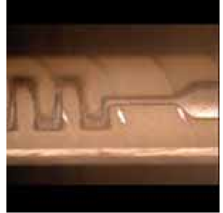
Verimetra has embedded its "serpentine" sensors in a catheter less than 1 millimeter in diameter.

According to the team's research, infants born today with hypoplastic