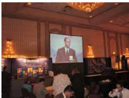
Figure 3. Exhibit area at PICS VIII & ENTICHS II Symposium

lent lectures on catheter intervention and hybrid intervention were given by the distinguished faculty.